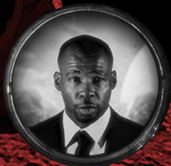
Cosmic TV Guide